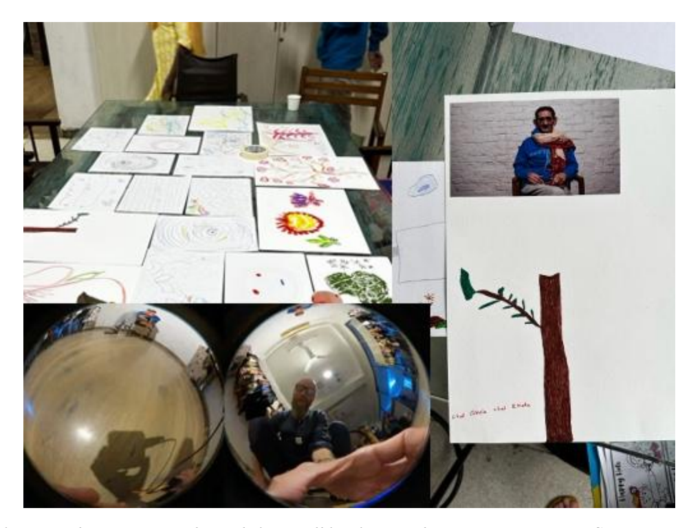
Doing things together. Images and People in a Delhi retirement home.